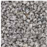
Silver Grey Granite 1-3mm, 2-5mm