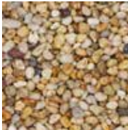
Dorset Gold 6-10mm