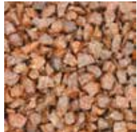
Nat.Red Granite 1-3mm, 2-5mm