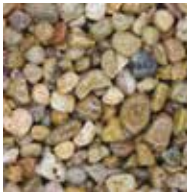
Trent Pea 6-10mm