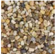
Rhine Gold 6-10mm