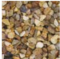
Corn Flint 6-10mm