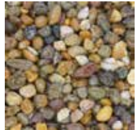
Brittany Bronze 6-10mm